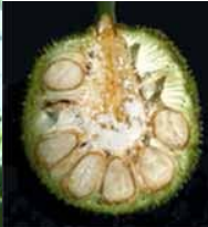
Breadnut ( Artocarpus camansi ). [Photos from http://breadfruit.ntbg.org/breadfruit/relatives/ ]