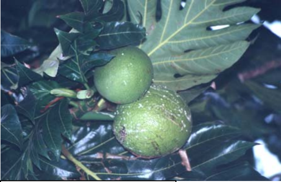
Young and mature breadfruit.